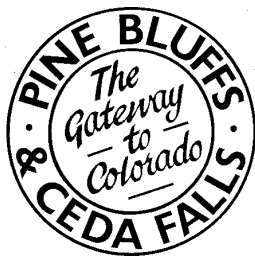
The new company logo of the Pine Bluffs and Ceda Falls Railroad. Featured on Company literature and some of its stock

The railway's head of engineering commented that they had nearly exhausted their supply of grey paint obtained by the former Chairman from a Navy surplus yard in 1945. The new color scheme, which is being applied to locomotives and cabooses, is predominately 'spruce green. However the scheme will feature grey roofs to retain a link with the past (and use up the remaining surplus paint).